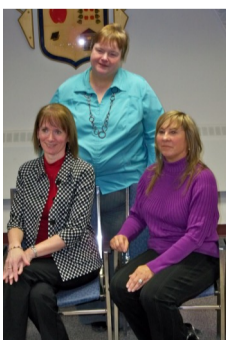
Ten Year Award Recipients