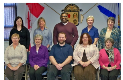
Five Year Award Recipients.