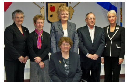
Dedication for 35, 40 and 45 years!